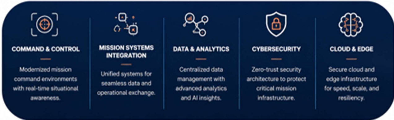
Mission Systems Modernization Frameworks Visual Overview

The modernization framework integrates aerospace command systems, mission operations, predictive analytics, cybersecurity controls, and cloud-edge infrastructure into a centralized modernization ecosystem supporting resilient aerospace missions.