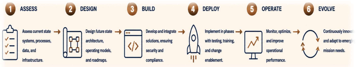
Implementation Roadmap Visual Overview

The Federal Aerospace Digital Modernization Initiative follows a structured transformation methodology designed to modernize aerospace operational environments through phased implementation, systems integration, infrastructure enhancement, AI deployment, cybersecurity validation, and continuous operational optimization. This approach supports scalable modernization while minimizing operational disruption and ensuring long-term mission readiness.